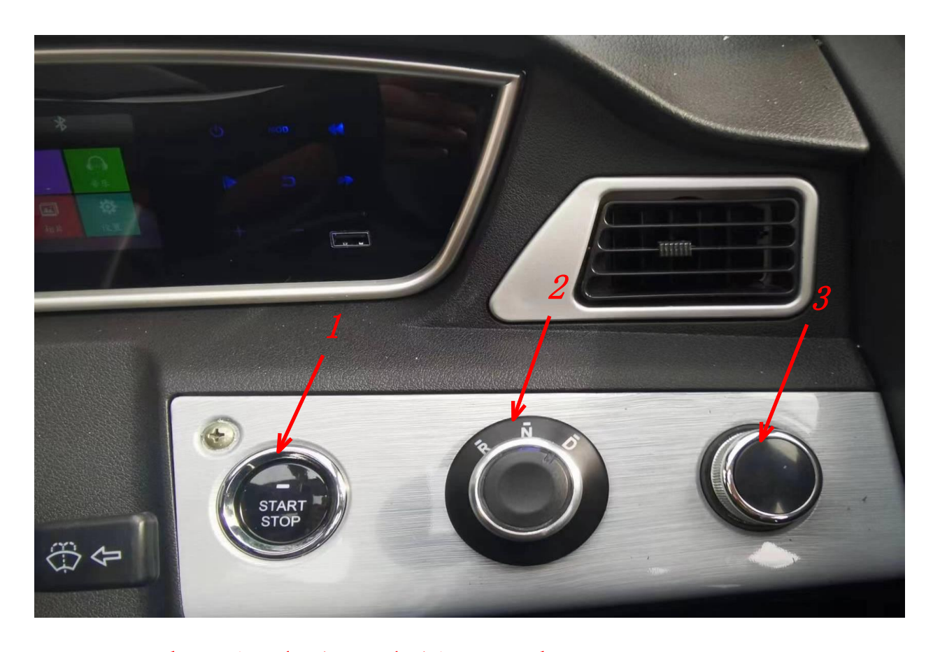
Panel switch A and Air outlet